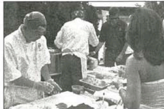
Guests dined on Prime's signature cuisine, including sushi.